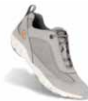
0019 grey HC