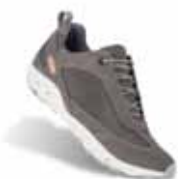
0020 dark grey