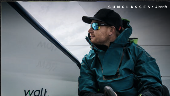
SUNGLASSES : Airdrift