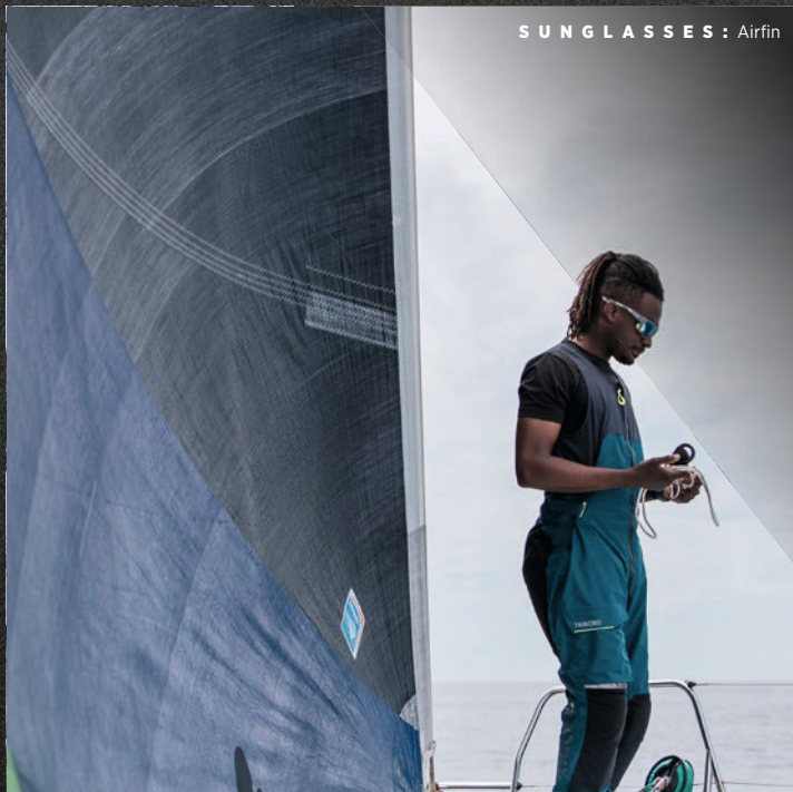
SUNGLASSES : Airfin