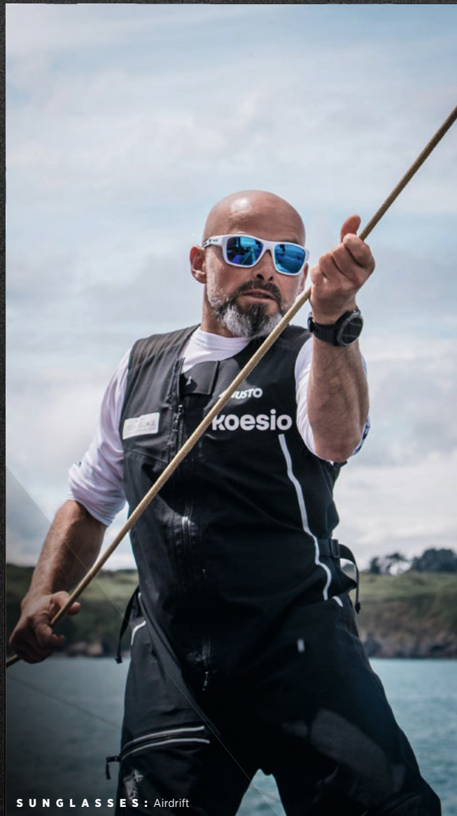
SUNGLASSES : Airdrift