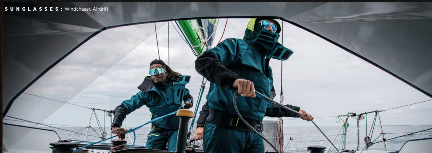
SUNGLASSES : Windchaser, Airdrift